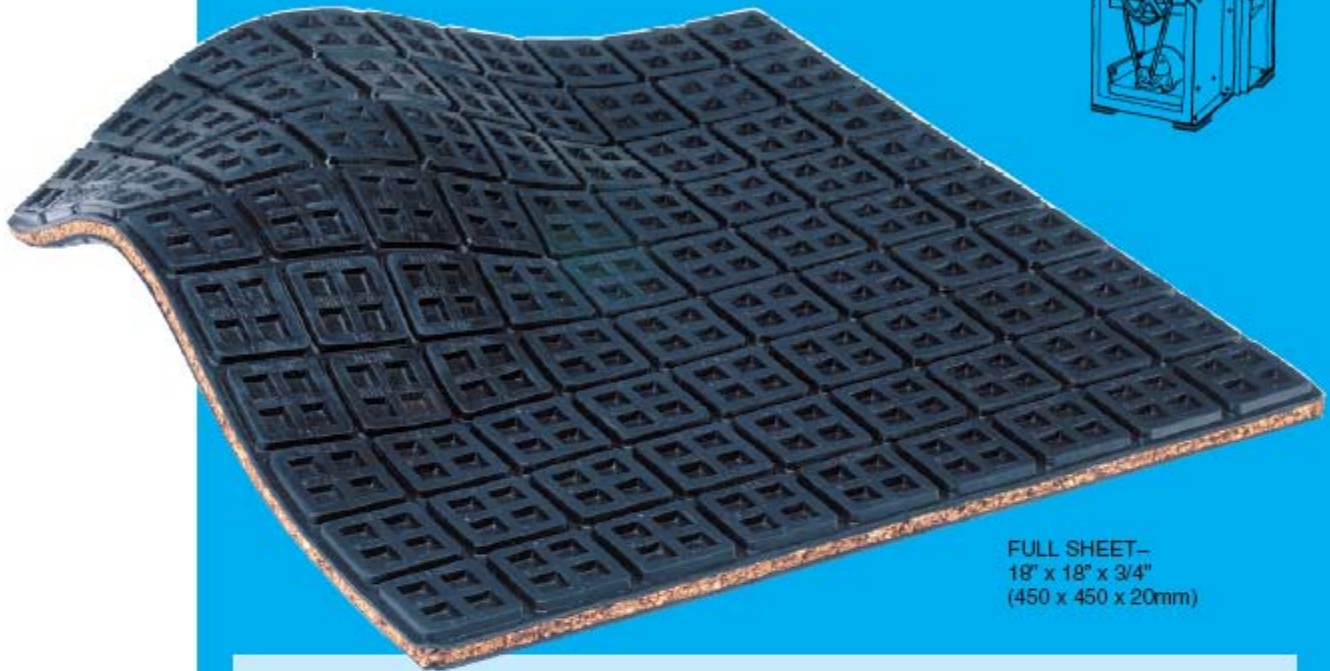
FULL SHEET— 18" x 18" x 3/4" (450 x 450 x 20mm)

It is more than 75 years since someone decided noise and vibration could be reduced more efficiently by a rubber layer on either side of a cork center. The idea caught on and these pads continue to be popular. Our pad is called NK.