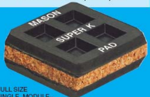
FULL SIZE SINGLE MODULE— 2" x 2" x 3/4"(25 x 25 x 20mm) Supports 200 lbs(91 kgs)