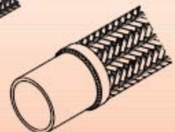
FEMALE COPPER SWEAT ENDS