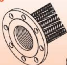
RAISED FACE FLANGES